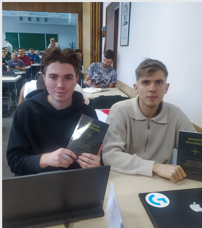
Belarus Seminary Students

In the coming years, we hope to recruit Regional Directors in various global locations to accelerate the impact of The 6:4 Fellowship. With members from over 90 nations, we are passionate to deepen the impact of pastors committed to prayer-and-Word-powered ministry.