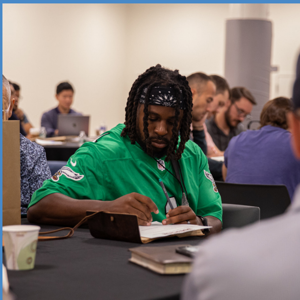
Prayer Immersion 2024