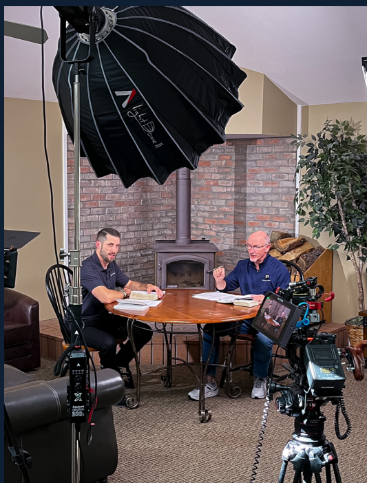
Transforming Wisdom Discipleship Group Video Shoot