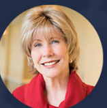
JONI EARECKSON TADA