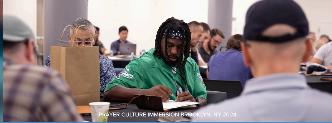
PRAYER CULTURE IMMERSION BROOKLYN, NY 2024